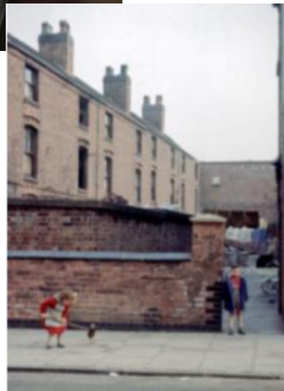
A Nettlefold Court.

Moor Pool History & Preservation Society