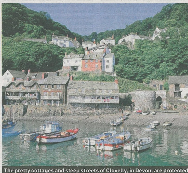
The pretty cottages and steep streets of Clovelly, in Devon, are protected