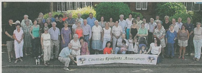
Residents of Wanstead Grove campaigned for conservation-area status

Another target to be named and shamed is Baron's Court conservation area, in west London. In the 1860s, it was a smart place to live, and the rows