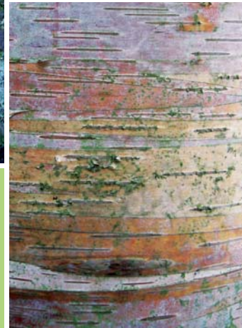
Bark detail on the Circle