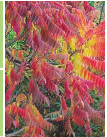
Branches catching the sun on Eastway