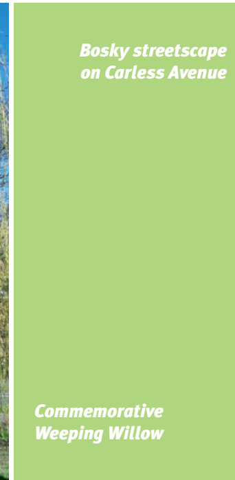
Commemorative Weeping Willow