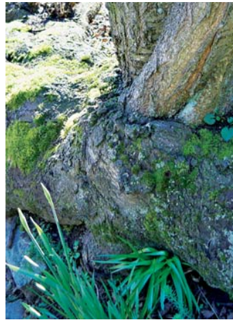
Kerbside detail of a mossy root on North Pathway